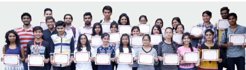
29 Students from MBA got Internships at Britannia Industries Ltd.